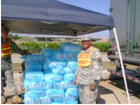
Texas Military Forces distribute ice in Bayou Vista, Sept. 18, 2008