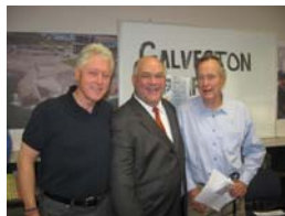
Presidents come calling