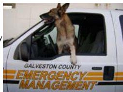
Cadaver dog rides the ferry

County enters MAA with Galveston FD to provide fire service on peninsula