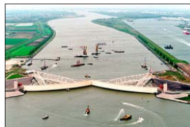
Maeslant Barrier near Rotterdam, Netherlands

Buy out properties that will flood again next time; prevent rebuilding in floodplains