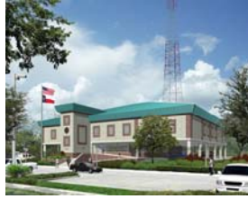
Galveston County Emergency Management Facility, May 2005

Catering plan to feed 300+ first responders